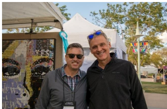
Artists at La Quinta Arts Festival.

LQAF Membership donations totaled $16,750 from 109 individual households during the 2018/19 fiscal year. This number included 48 artists who joined or renewed at the Artist Member level offering the benefit of inclusion on our LQAF.com Artist Galleries with on-line profiles, artist statements, and website links in addition to their image galleries. Artist Members who participate in La Quinta Arts Festival are linked to their respective Artist Gallery via the Festival 2019 Participating Artists webpage.