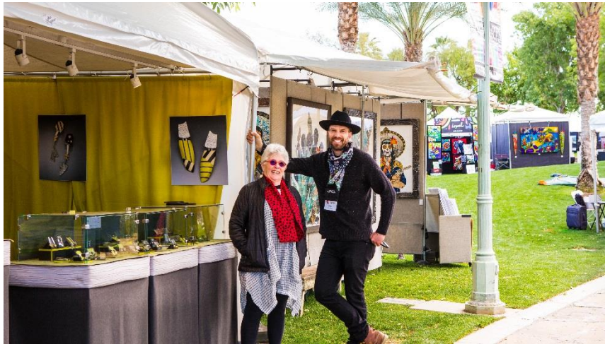
Artists at La Quinta Arts Festival.